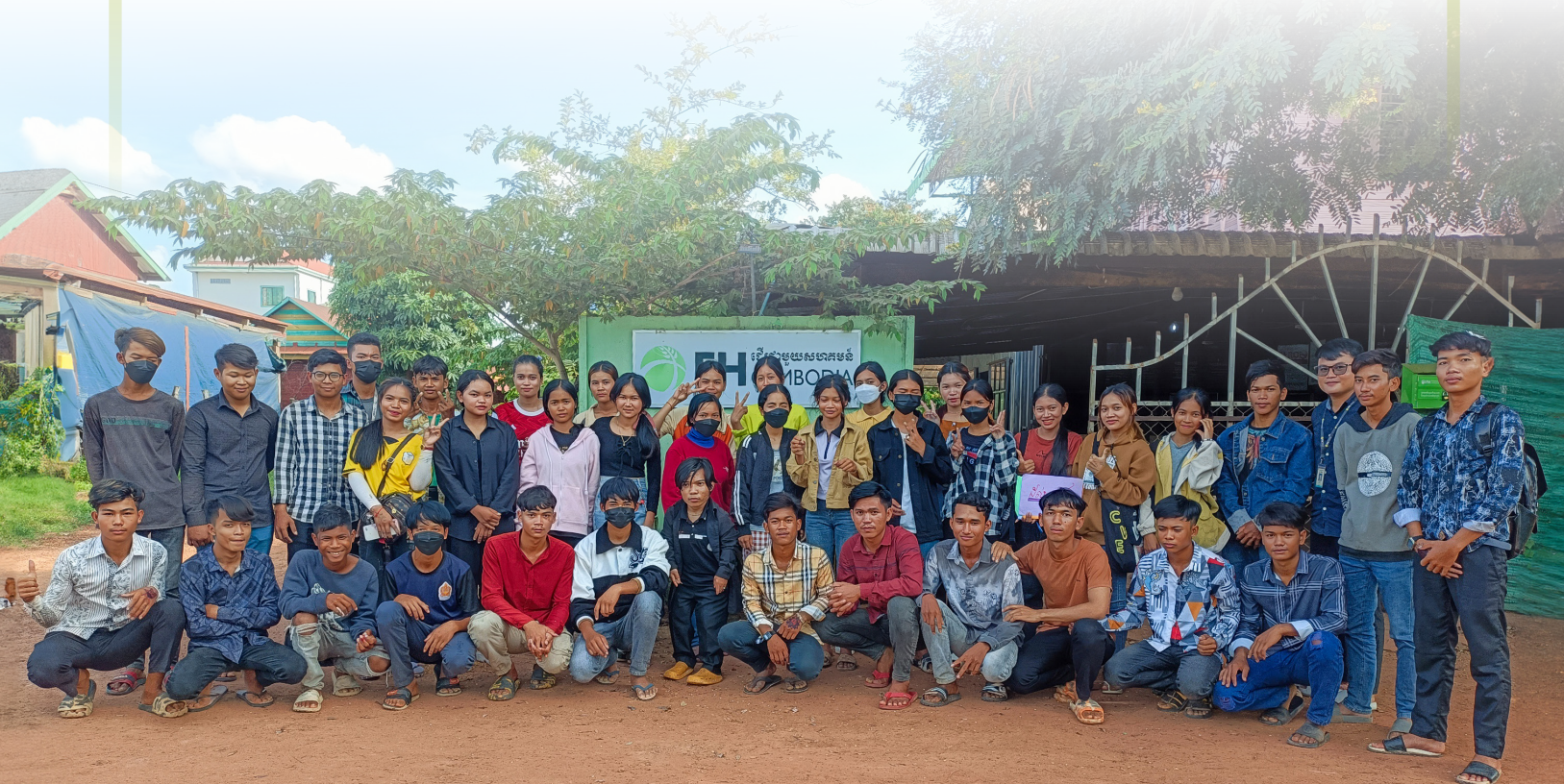
A group of youth from the Youth Livelihood Development (YLD) project received soft skills training to boost their skill sets.

Last but not least, we're excited about celebrating the culmination of FH partnership with Svay Leu II in the fall of 2024!