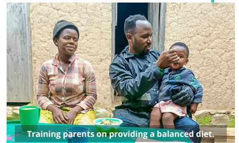
Training parents on providing a balanced diet.

"I participated in a refresher training for community health volunteers. FH revamped and supported us; today we are monitoring the [growth and] nutrition of children. Due to FH's empowerment, we will continue to monitor the growth of our children ourselves with little support from outside of the community. We extend our deepest appreciation."