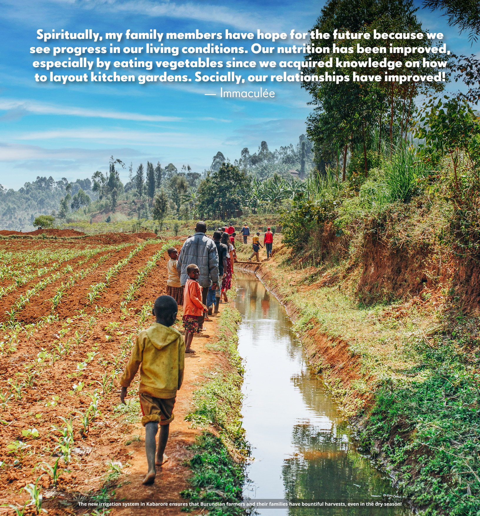
The new irrigation system in Kabarore ensures that Burundian farmers and their families have bountiful harvests, even in the dry season!