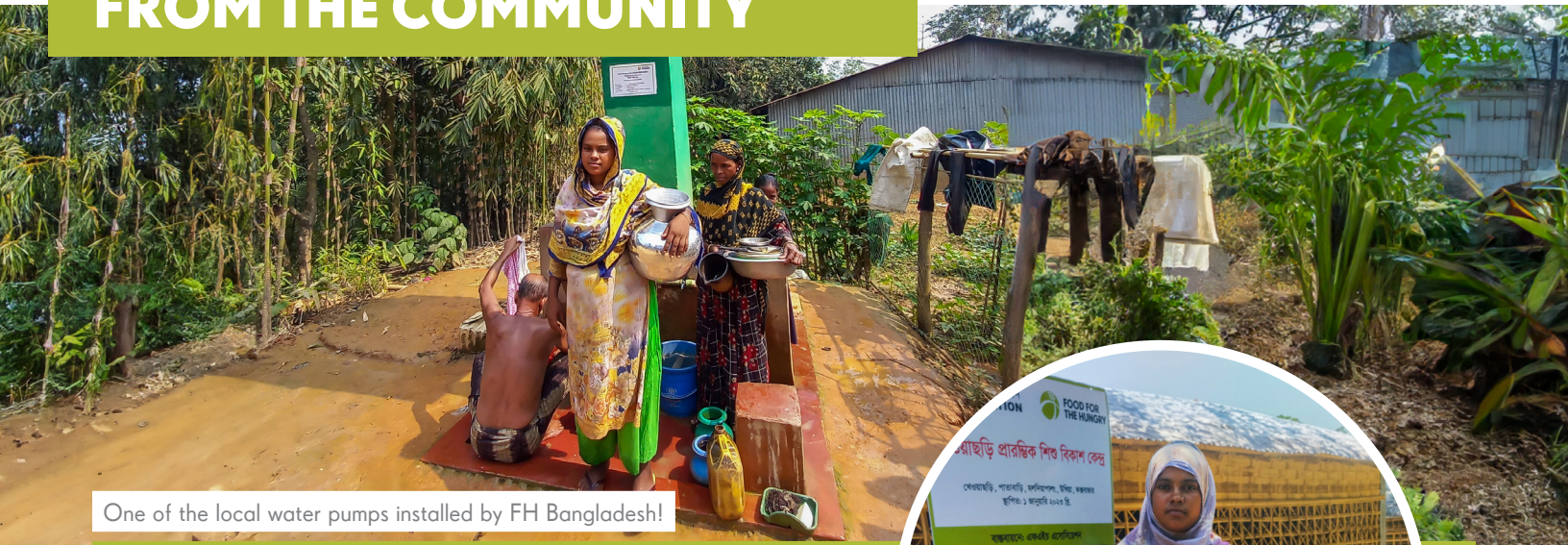
One of the local water pumps installed by FH Bangladesh!